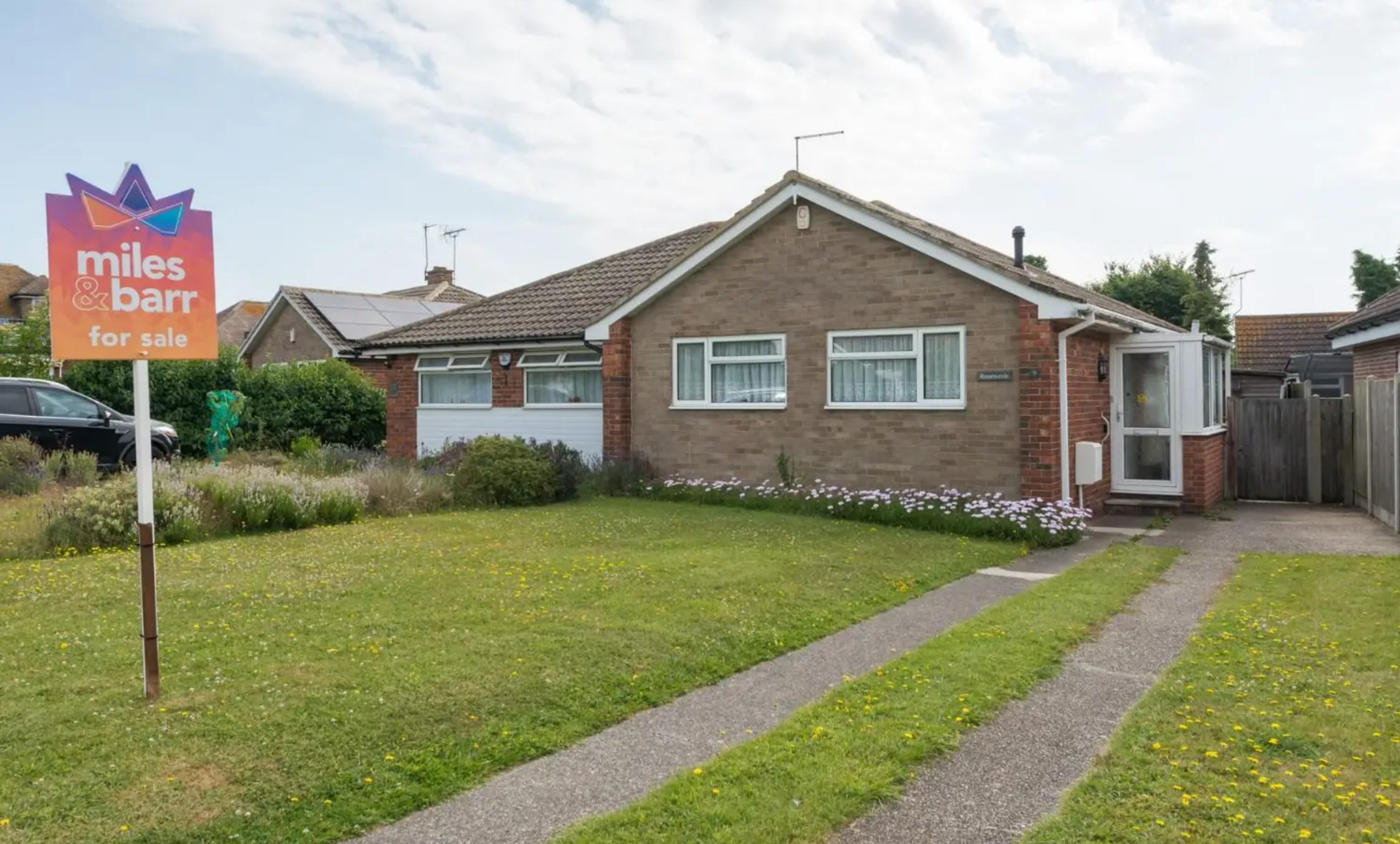
9 Cherry Tree Gardens, Ramsgate £300,000