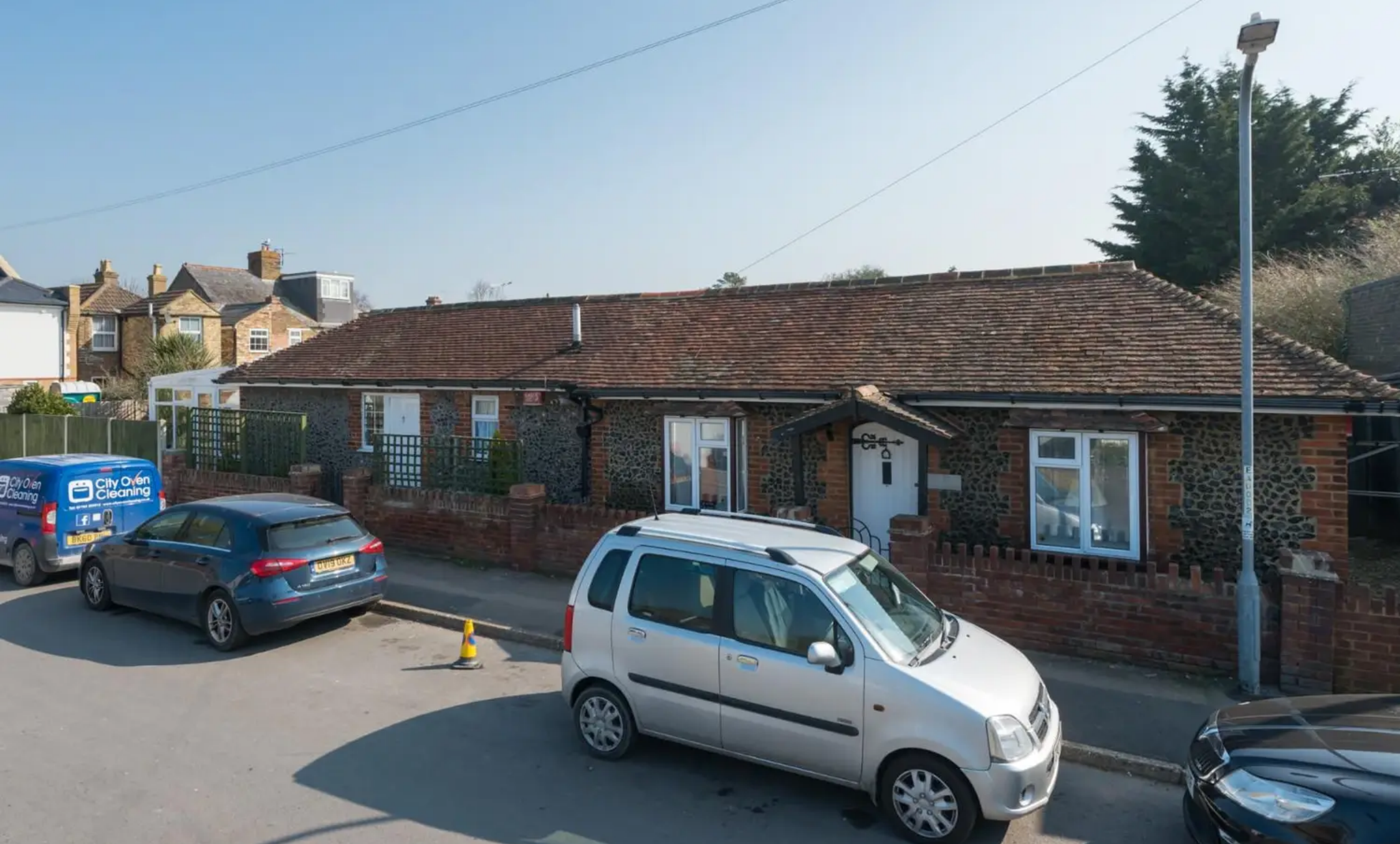
The Old Bungalow Egbert Road, Minster £395,000