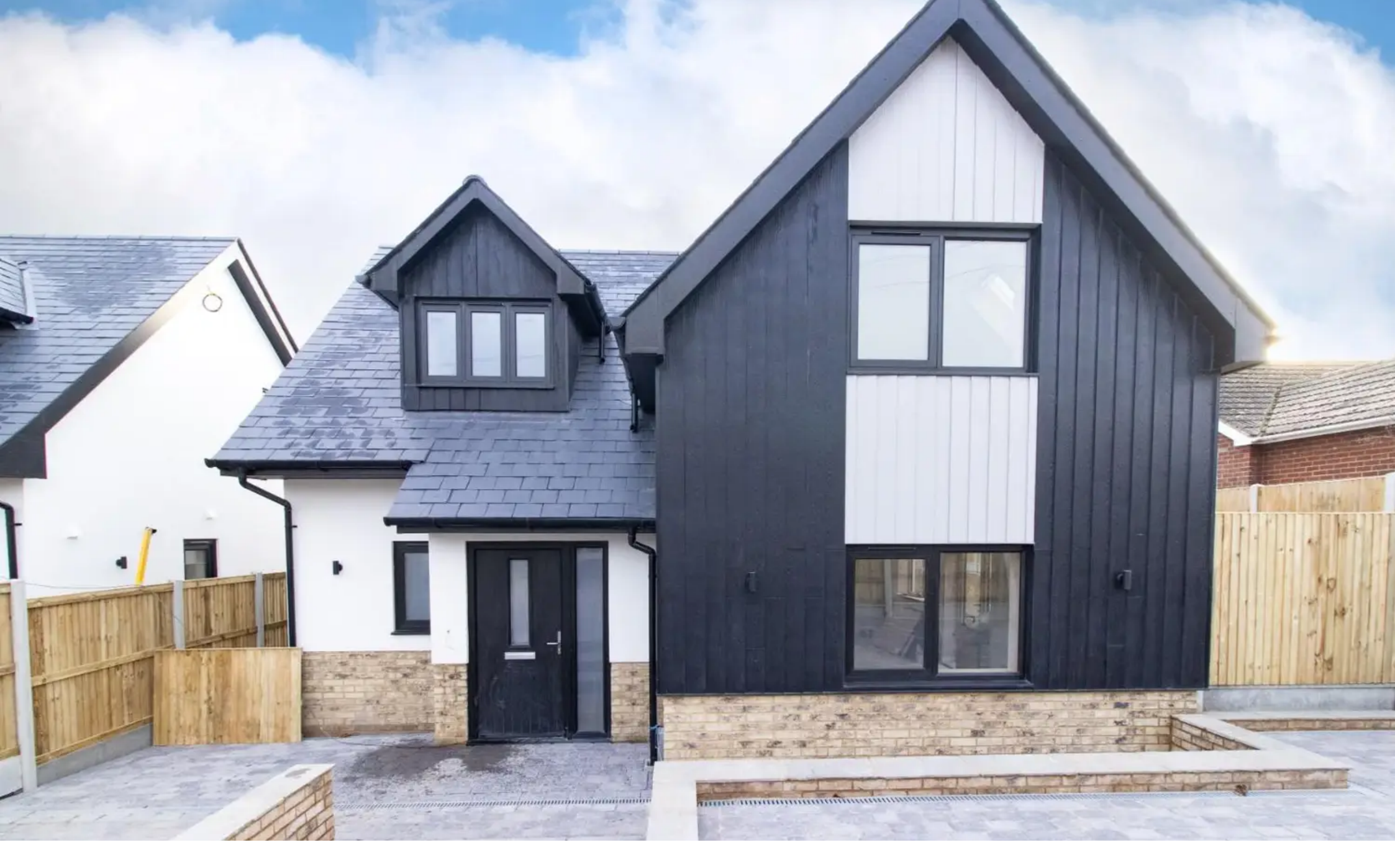
46 Wilkes Road, Broadstairs £595,000