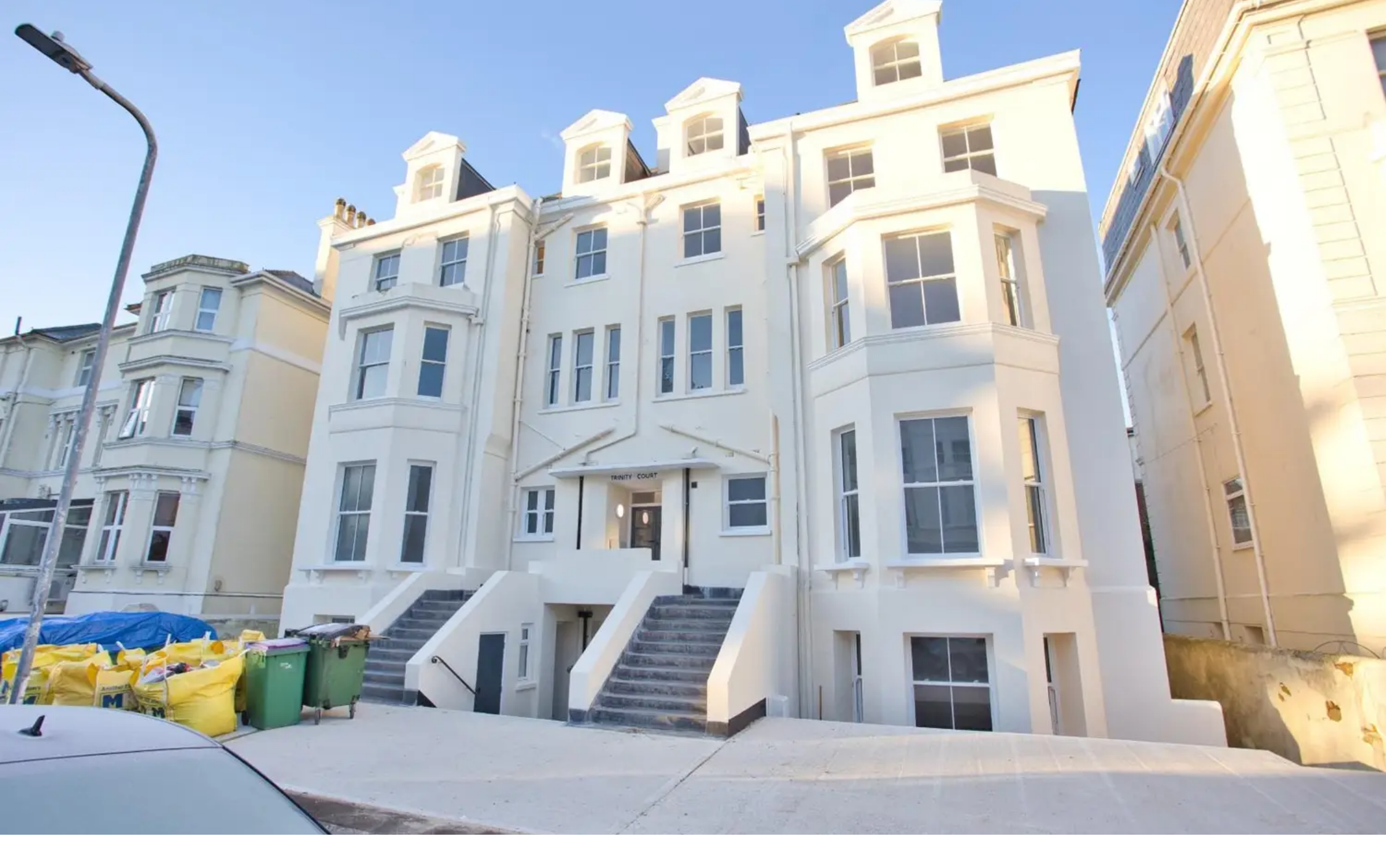
Flat 2, Trinity Court 5-7 Trinity Gardens, Folkestone Guide Price £325,000