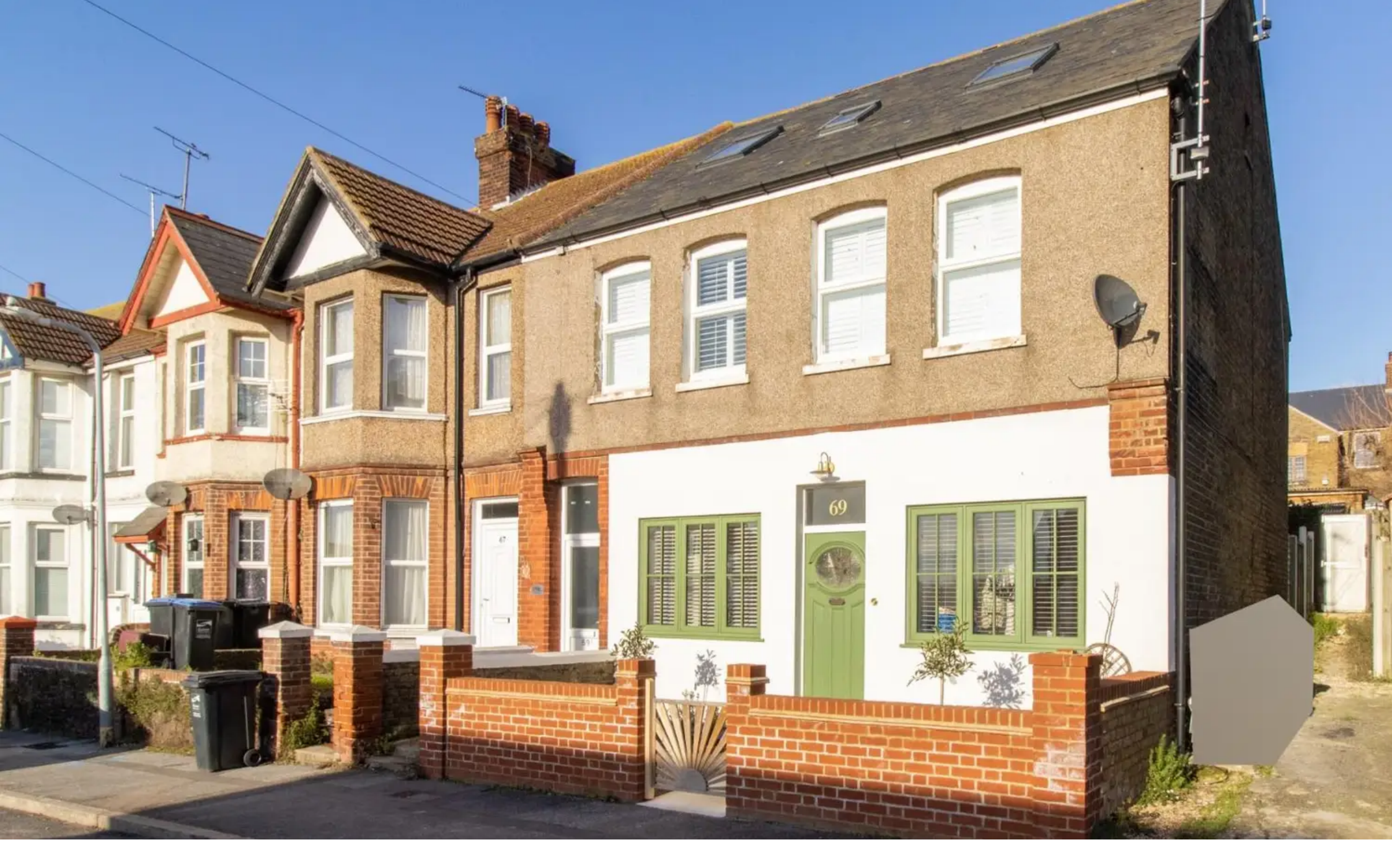
69 Fitzroy Avenue, Margate Offers Over £237,500