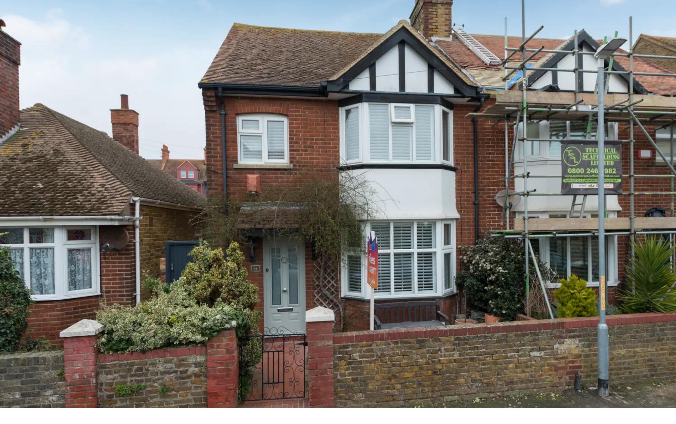
26 Queens Road, Ramsgate £450,000