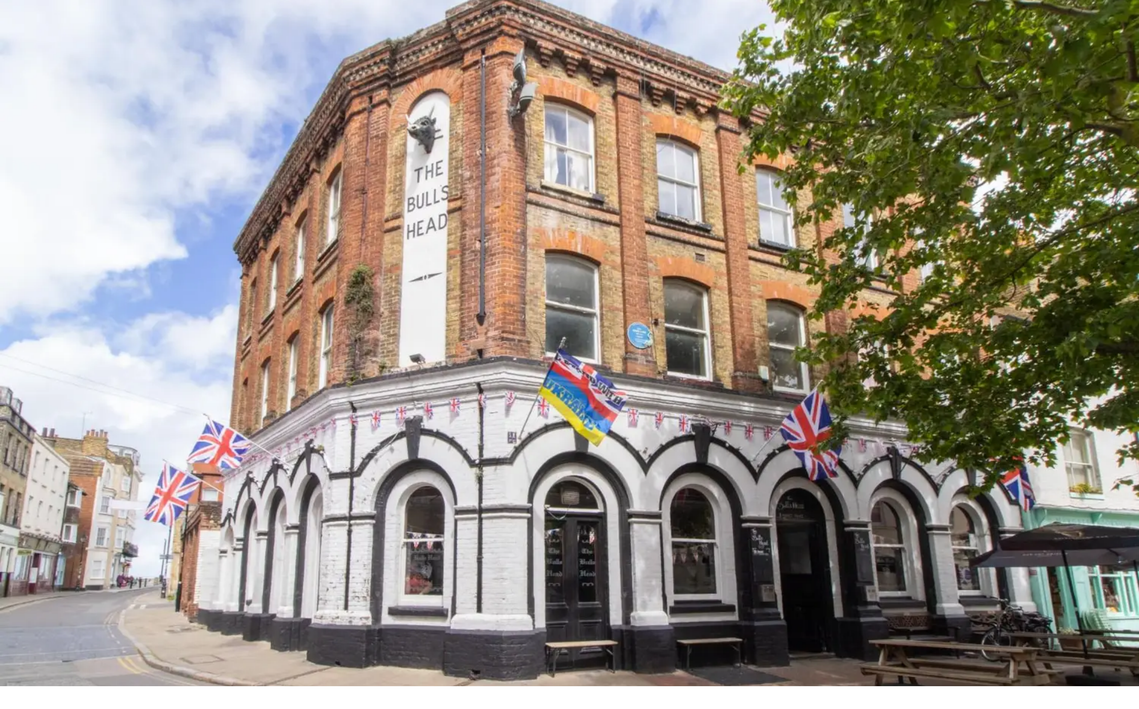
Flat 4, 1 Market Place, Margate £225,000