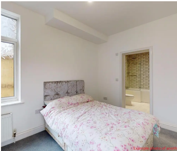
Example photo of another home in the building