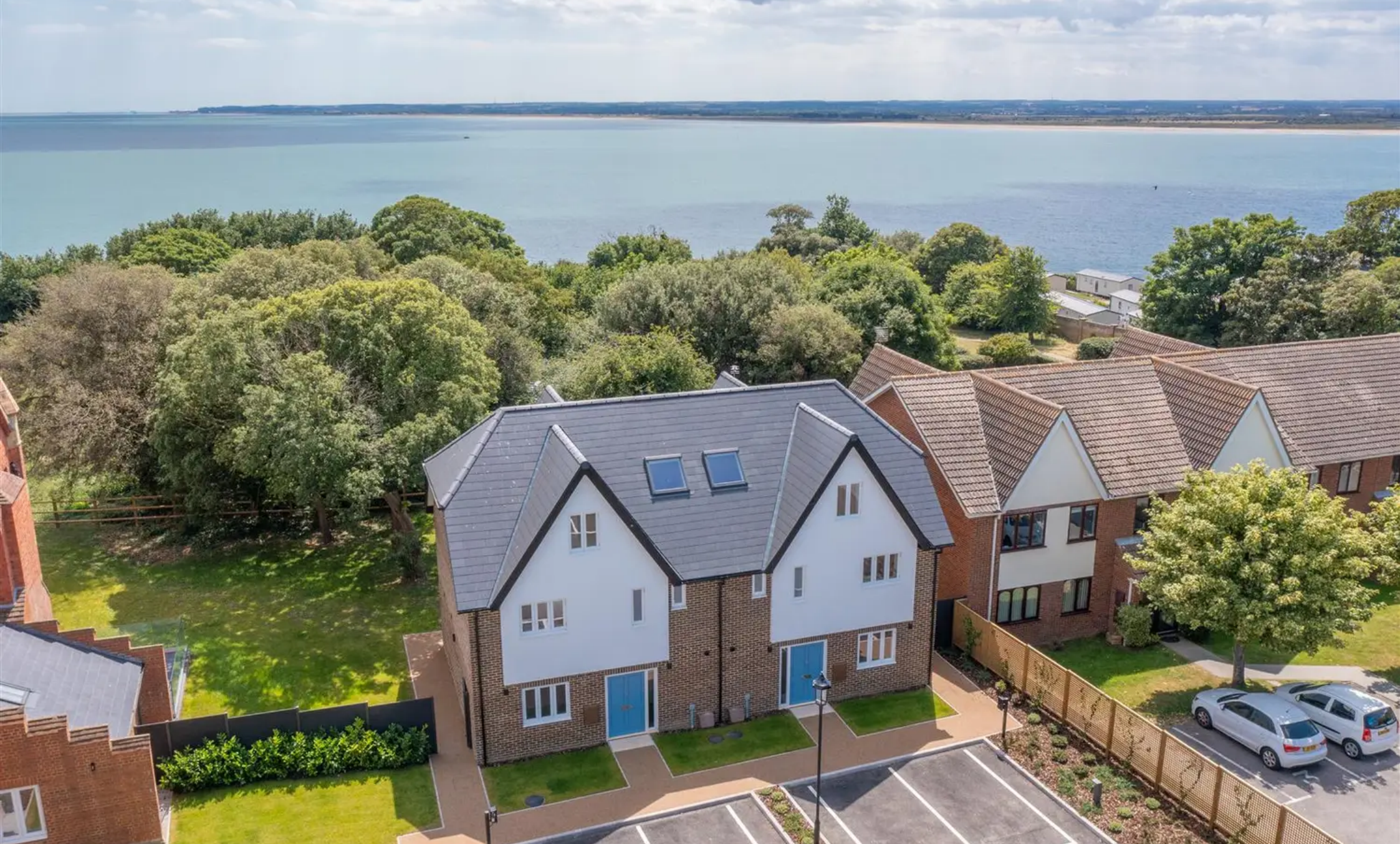
8 Courtstairs Manor, Ramsgate £750,000