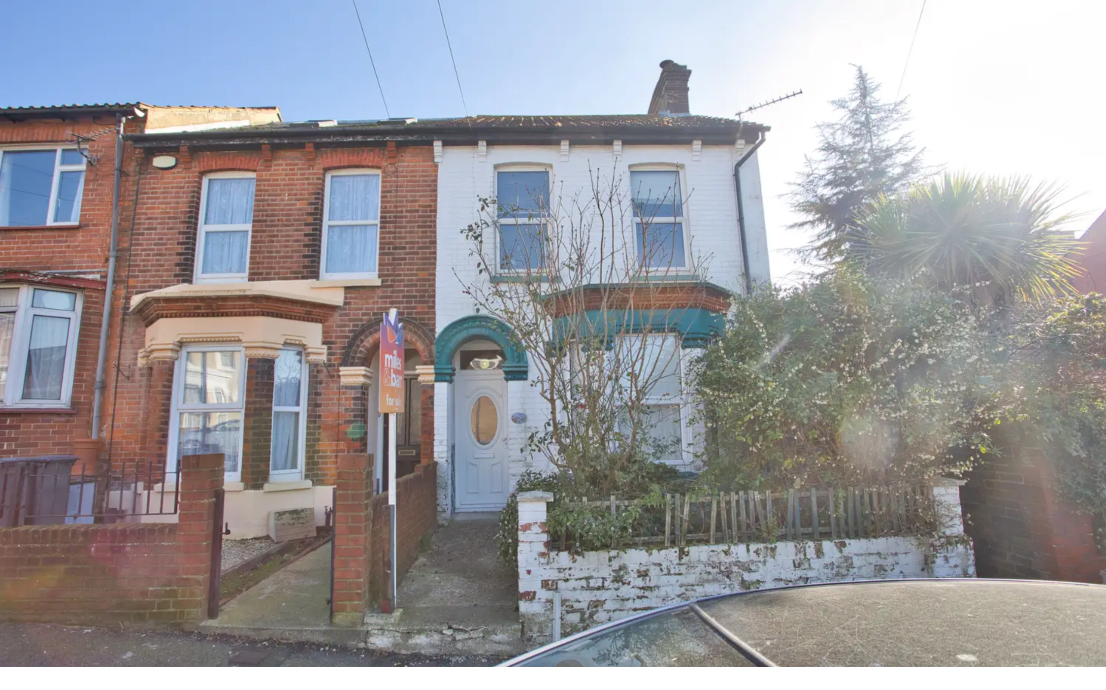
2 Astley Avenue, Dover £225,000