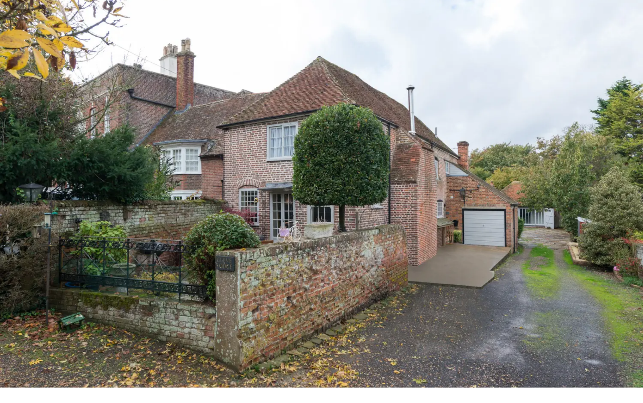
Cleve Lodge Minster Road, Monkton Guide Price £550,000