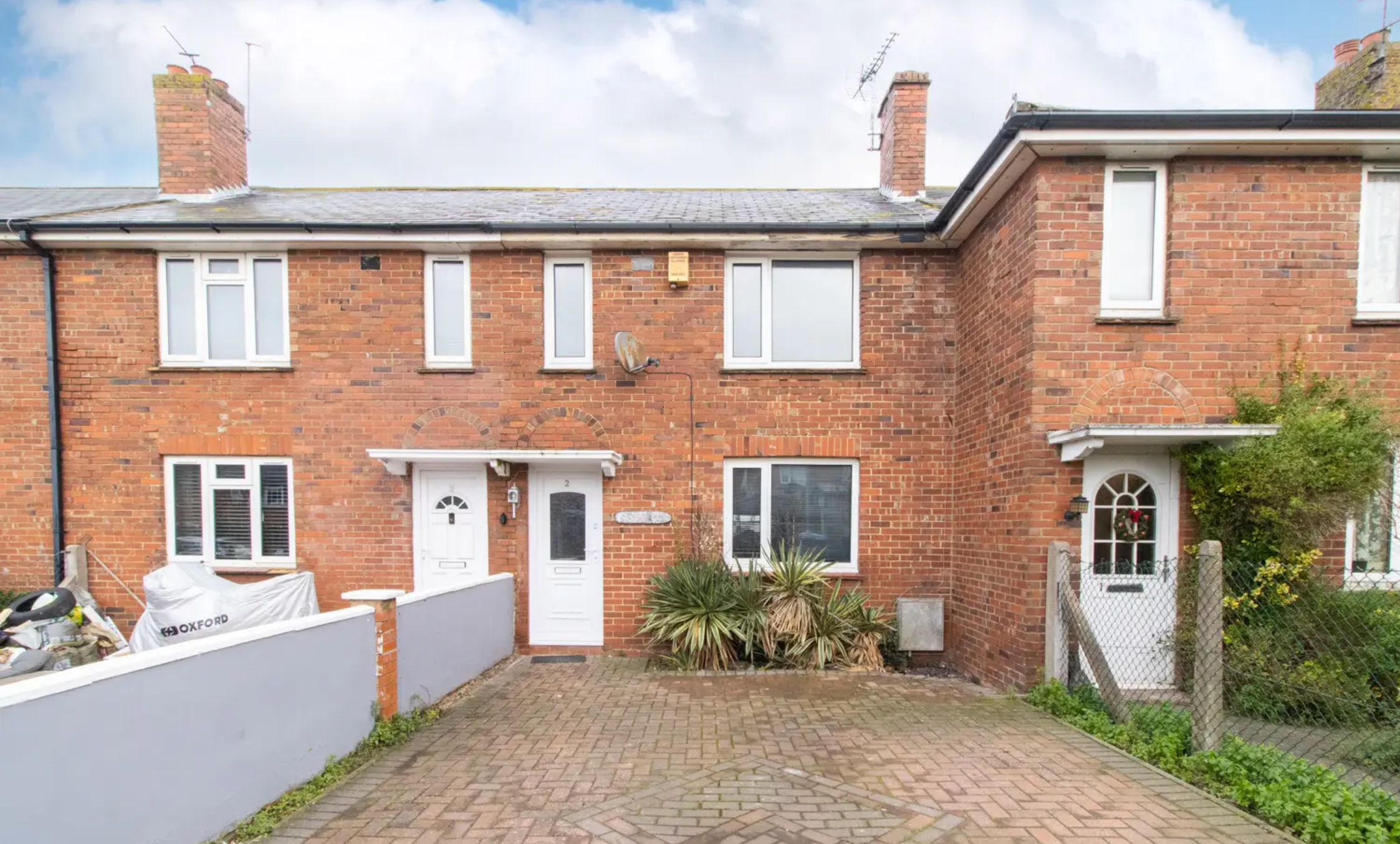
2 Osborne Terrace, Margate £280,000