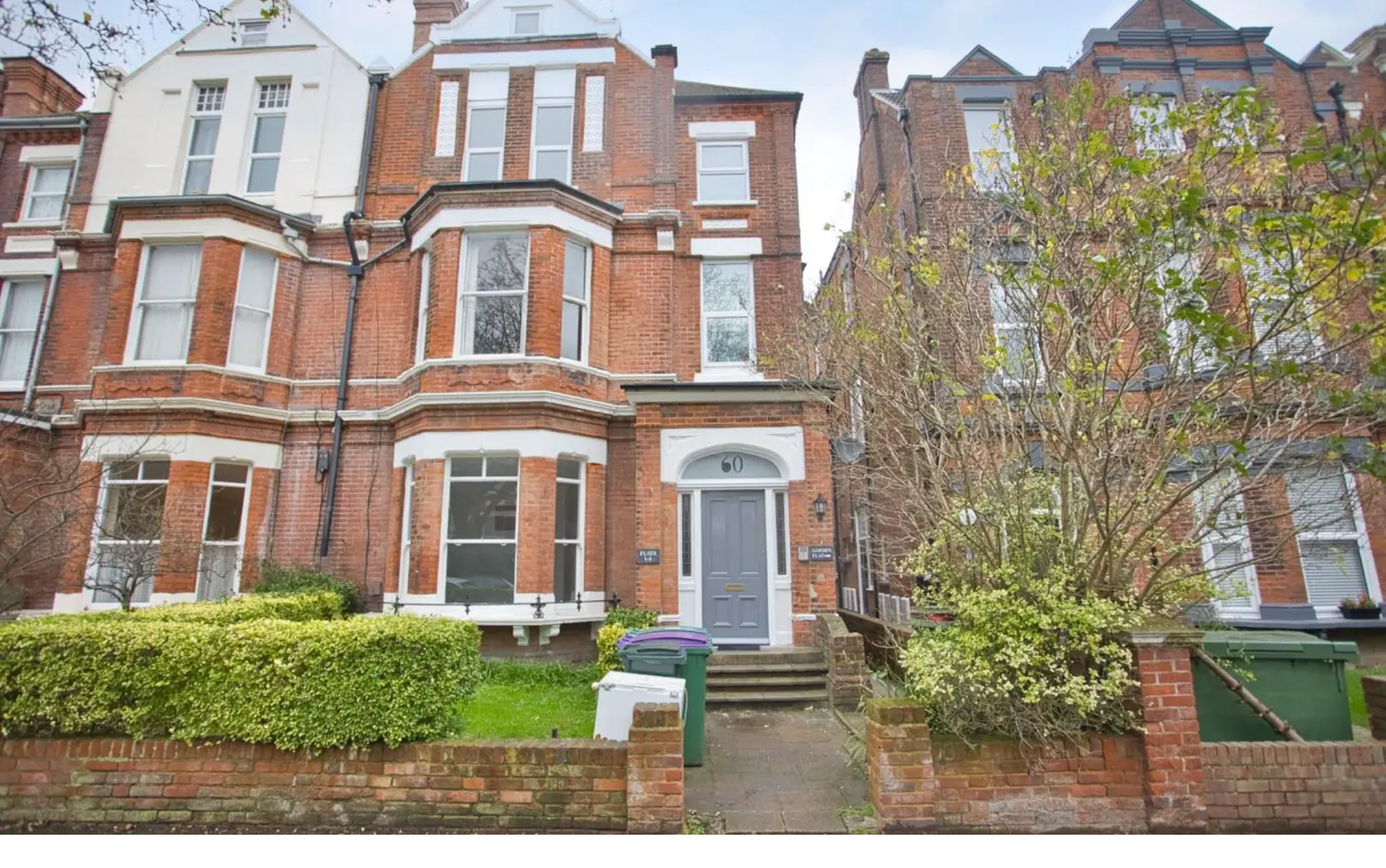
Flat 1, 60 Bouverie Road West, Folkestone Guide Price £240,000