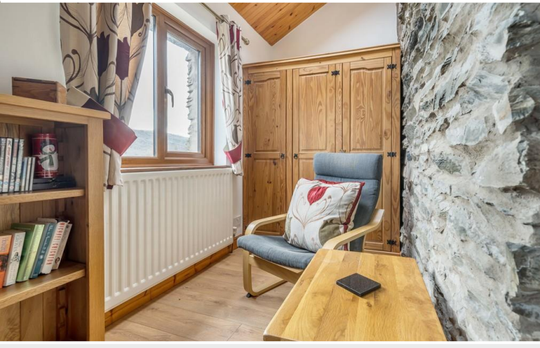
Lounge - Quiet Area

Description Converted in 2000, 4 The Barns is the most charming and quirky of properties - with thick imperfect exposed stone walls, deep set windows and exposed beams arranged over many levels and with lots of nooks and crannies! If completely unique with charm and charachter and superb open views are your thing then look no further - this will not disappoint.