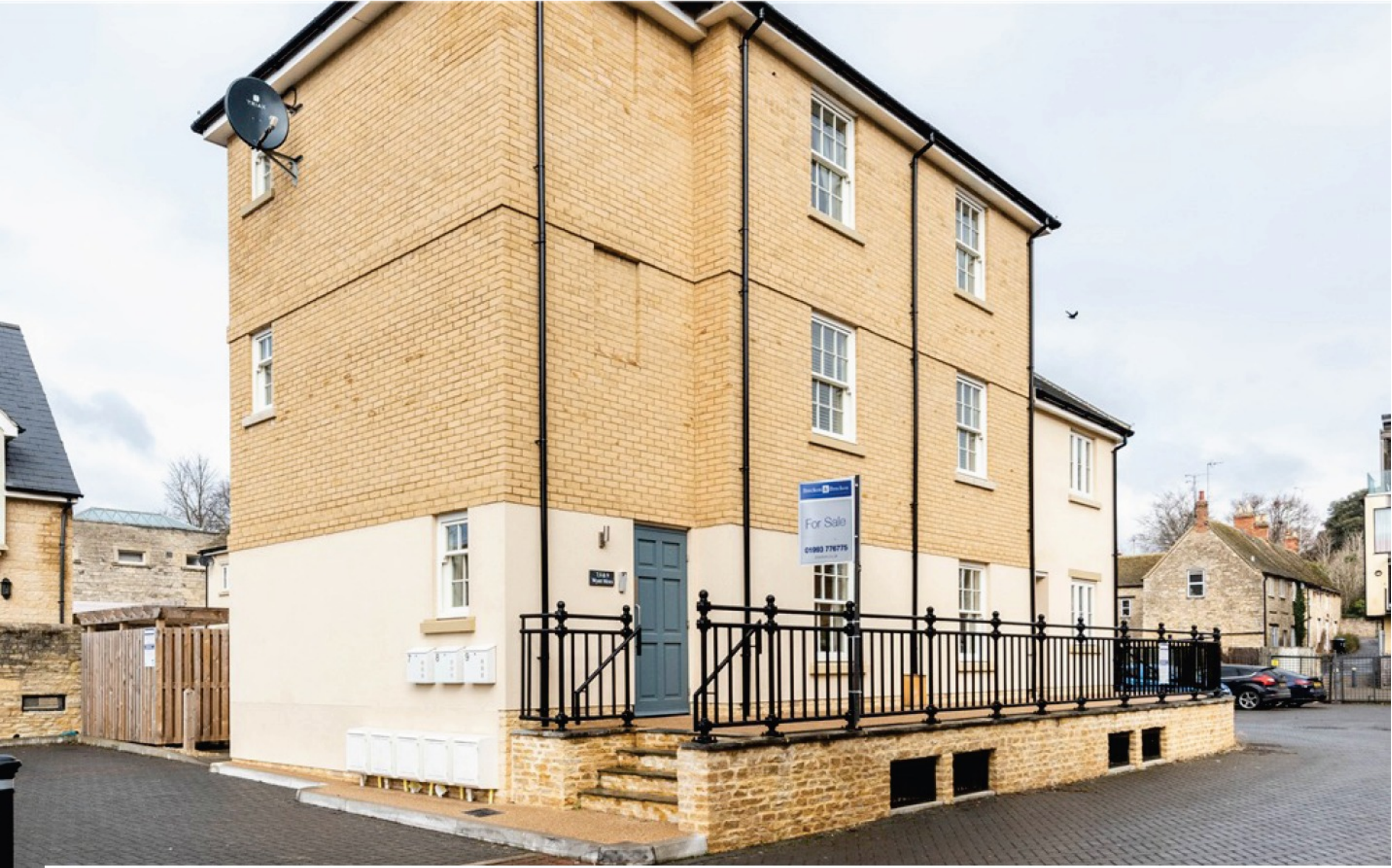
Wyatt Mews, Witney