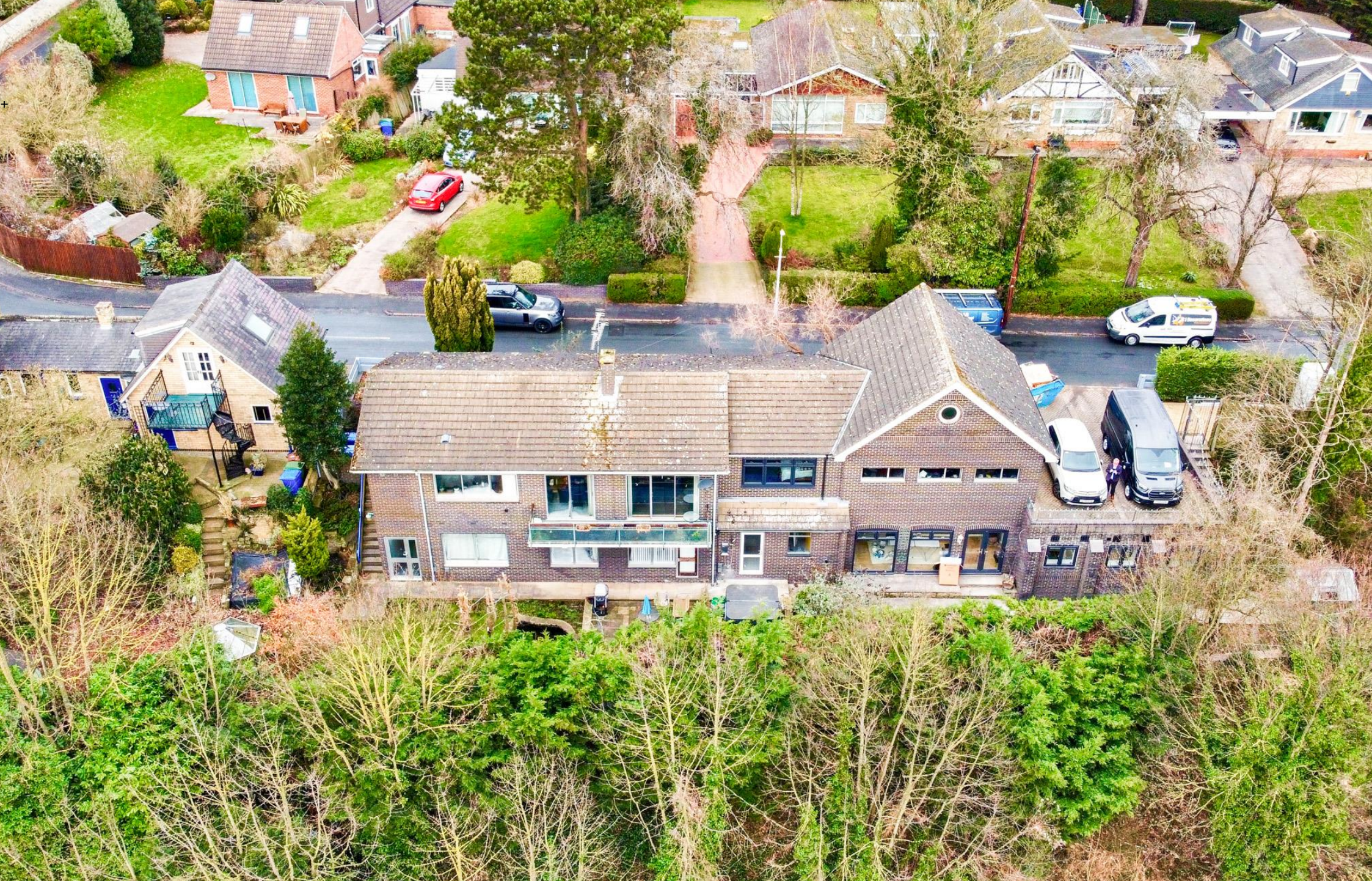
Krowdrah, Southfield, Hesse HU13 0EL