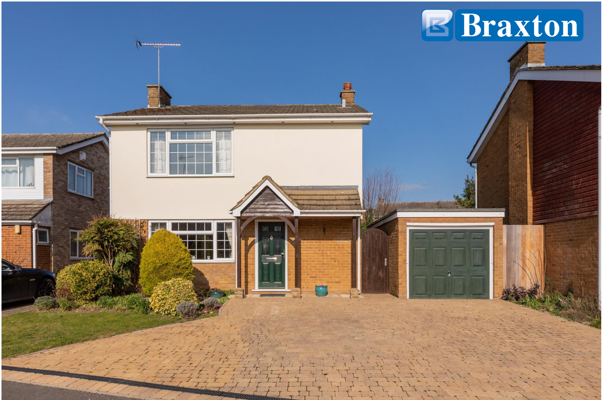
4 Fairlea, Maidenhead, Berkshire SL6 3AS