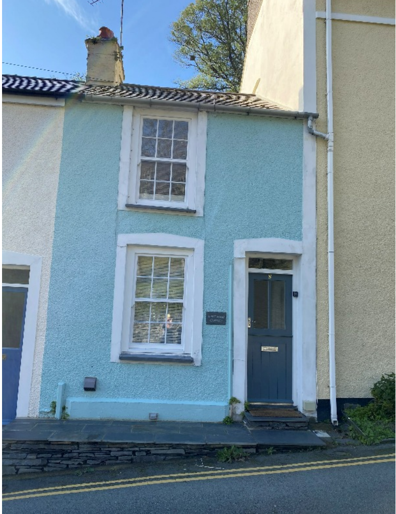
Charming 2 bedroom cottage of character Situated in a quiet location Rear elevated terraces with estuary views