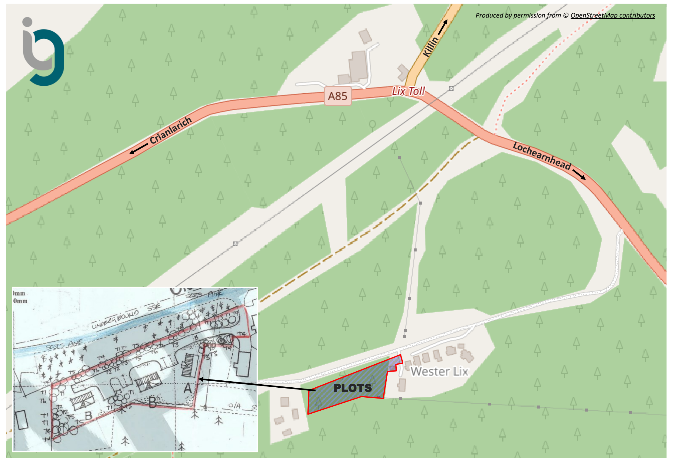
These particulars are believed to be correct, but their accuracy is not guaranteed and they do not form part of any contract. They are provided as a general guide and may be subject to change. All measurements are approximate only.