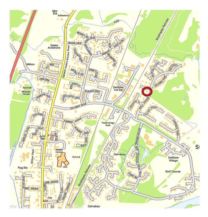
Contains Ordnance Survey data © Crown copyright and database right 2015.