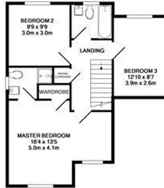
1ST FLOOR APPROX. FLOOR AREA 549 SQ.FT. (51.0 SQ.M.)

TOTAL APPROX. FLOOR AREA 1175 SQ.FT. (109.2 SQ.M.)