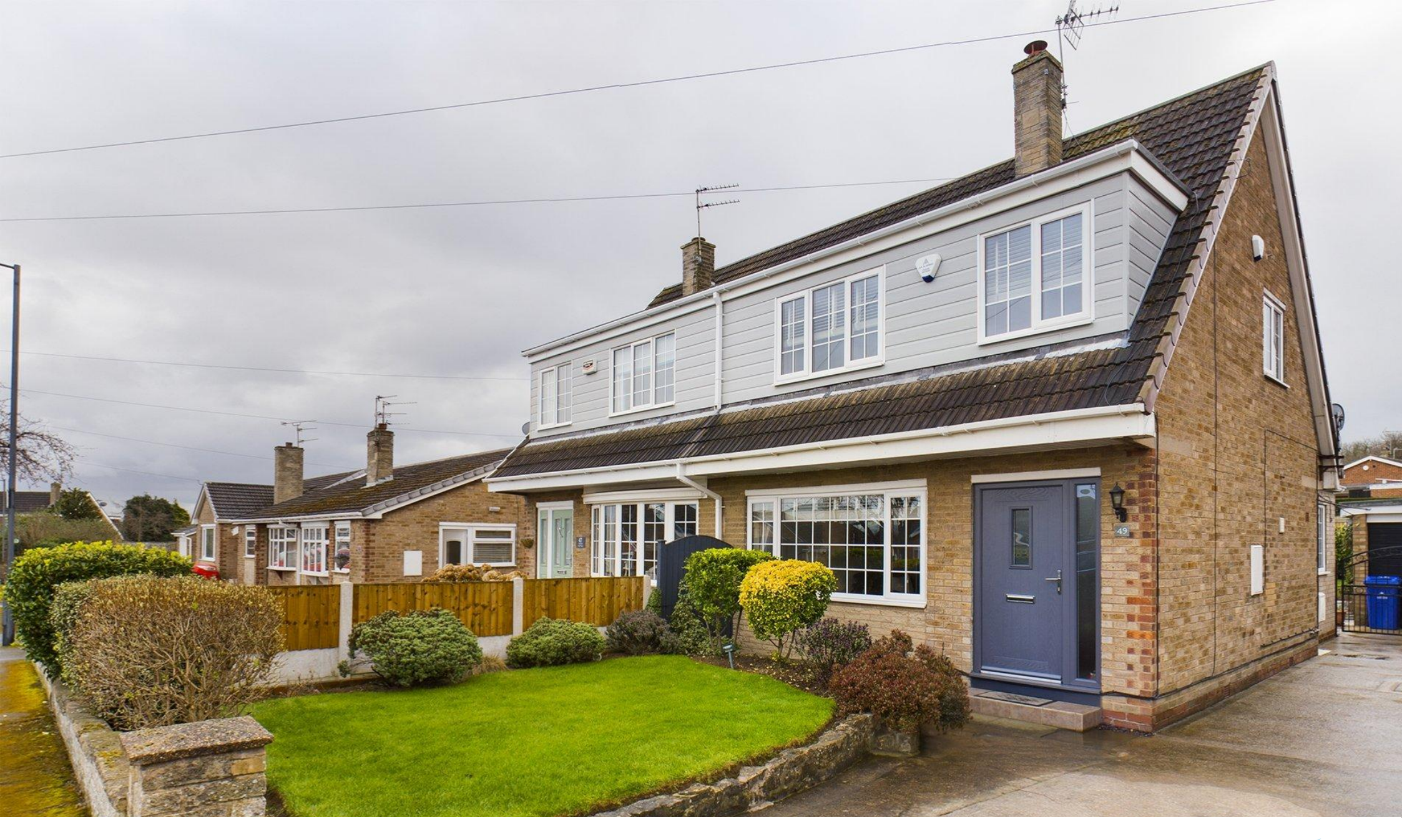
49 Leyburn Road, Doncaster, DN6 8NH Offers In Excess Of £200,000 Freehold