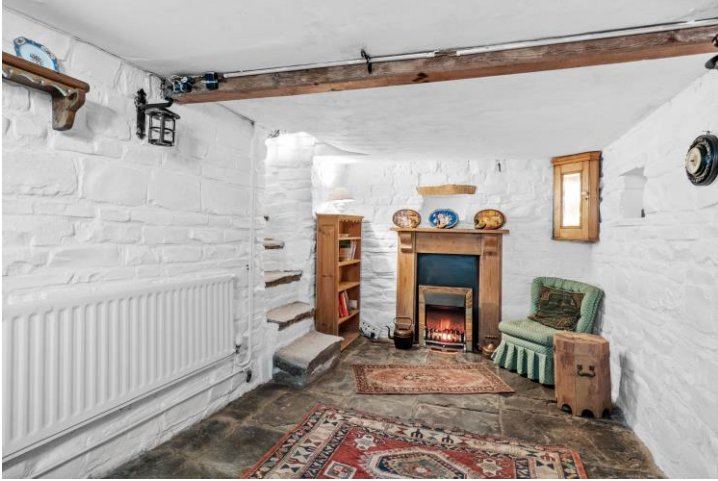
Cellar (currently used as dining room) 16' 3" (4.95m) 8' 3" (2.51m)