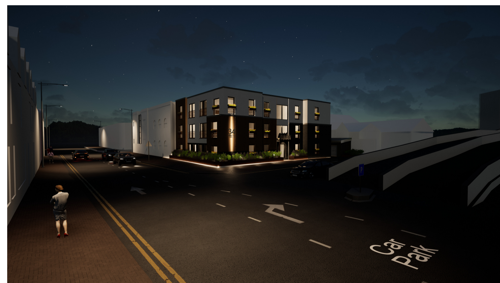
View from Opposite Car Park Ramp