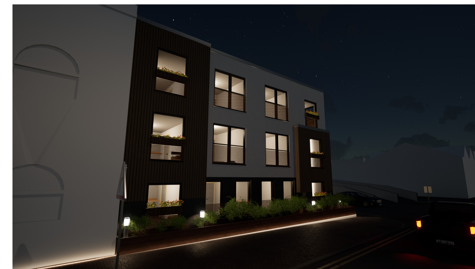
View from Murry Street Ground Level

Notes This drawing is copyrighted and must not be reproduced or disclosed to third parties without the prior written permission of Prime Architecture Limited. Do not scale from this drawing. Responsibility will not be accepted by Prime Architecture Limited for errors made by others scaling from the drawing. Use written dimensions only. Contractor to verify all dimensions before commencing work on site. Prime Architecture Limited are to be notified immediately in writing of any discrepancies. All survey information incorporated within the drawings cannot be guaranteed as accurate unless confirmed by a fixed dimension. All dimensions are in millimeters unless otherwise noted. This drawing is to be read in conjunction with all relevant project drawings and specification prepared by Prime Architecture Limited and other relevant consultants, specialists, etc. CDM notes are provided to assist the contractor in managing residual hazards identified during the design stage. Any such notes do not relieve the contractor of their duties and they must provide a safe system of work based on method statements, risk assessments, etc.