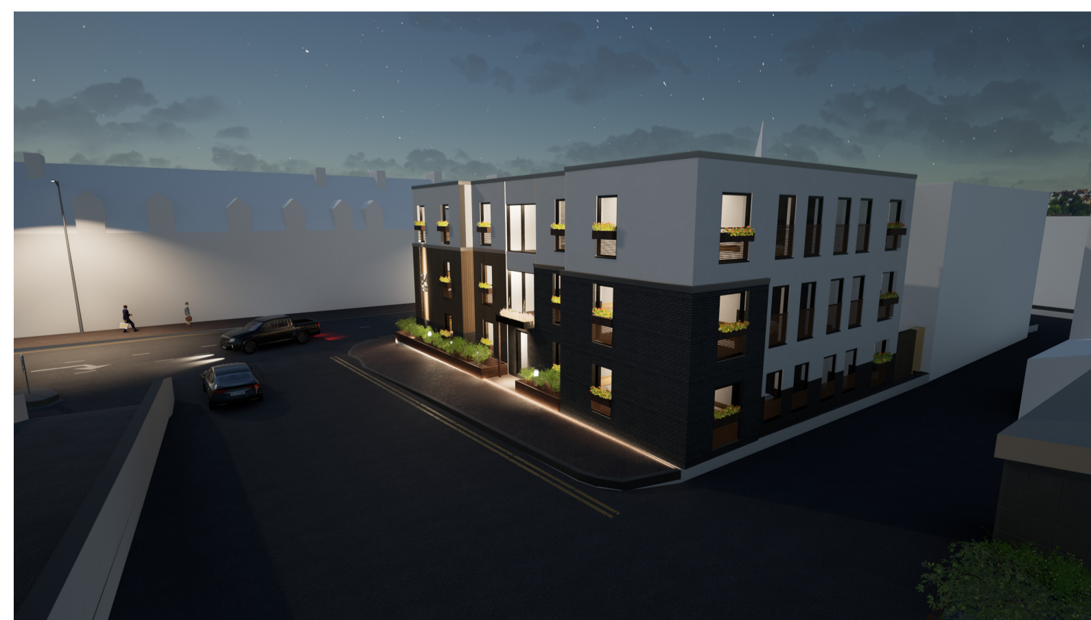
View from Car Pack Entrance