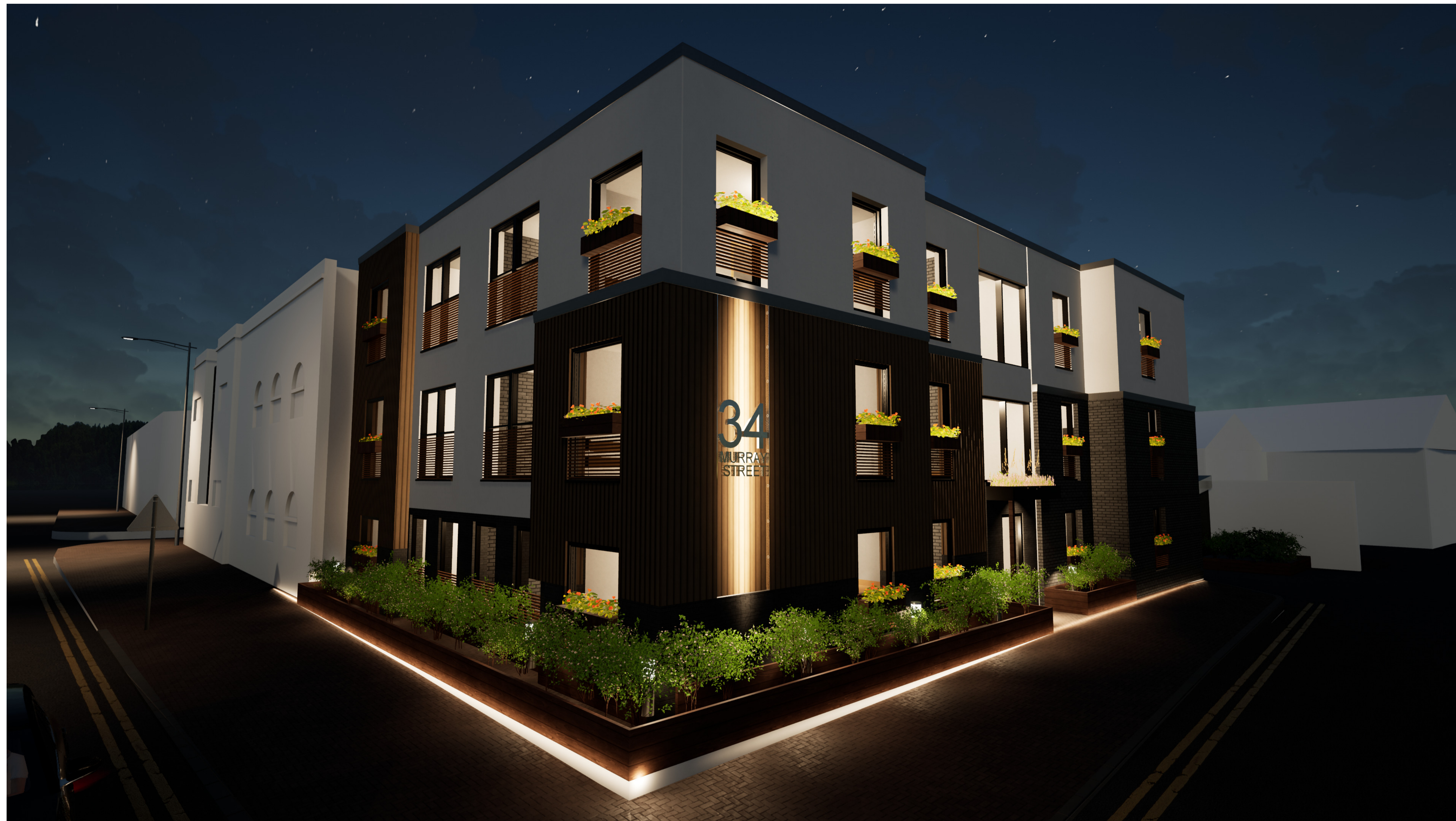
No.34 Murray Street Main Entrance