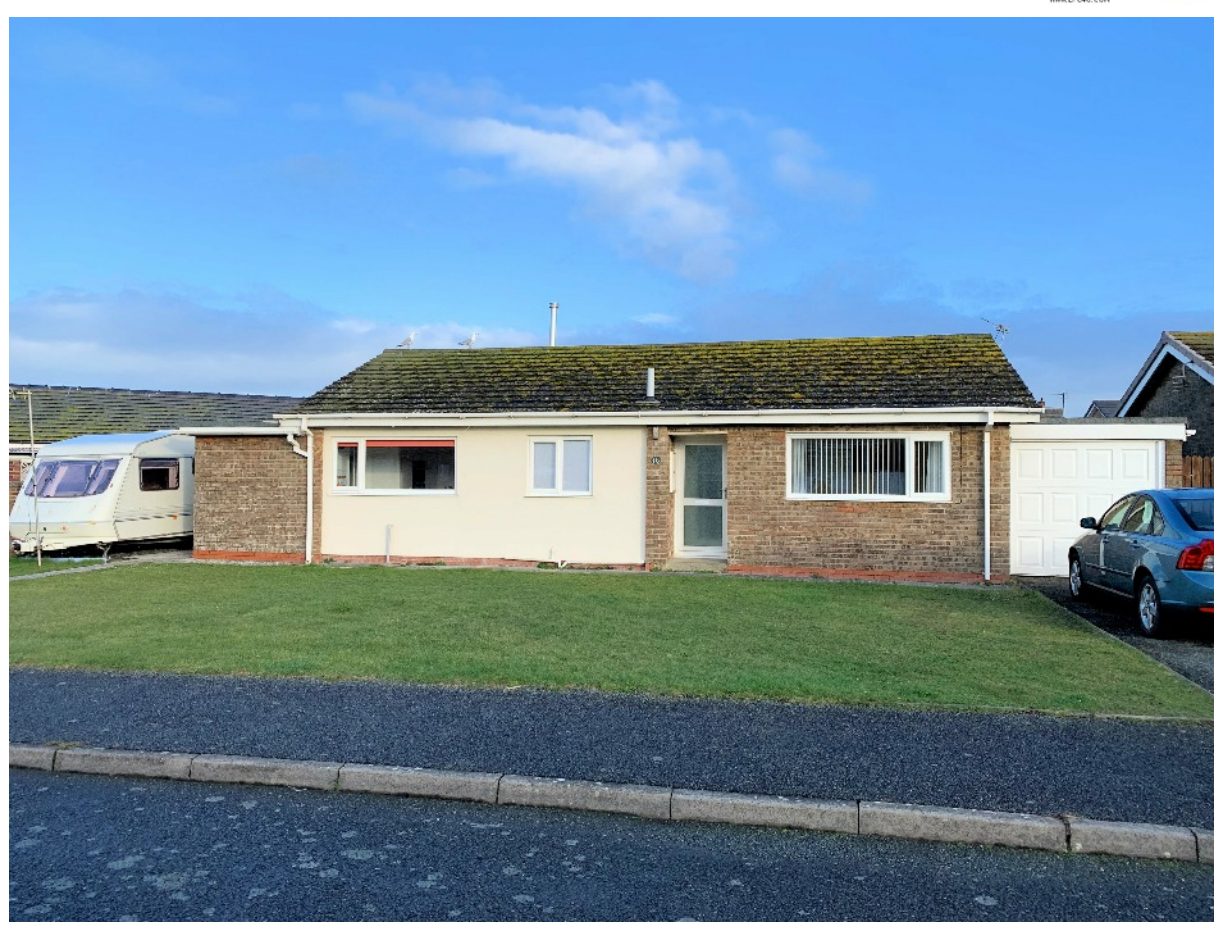
Well presented 3 bedroom detached bungalow Situated on this estate of individually designed and built properties Enclosed rear garden, parking and garage.