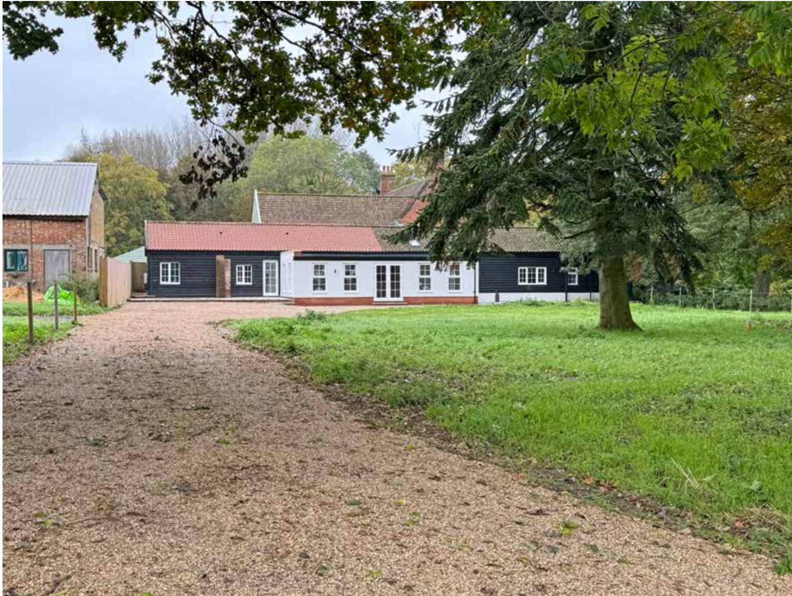
'STYLISH OPEN CONCEPT HOME' Banham, Norfolk | NR16 2DE