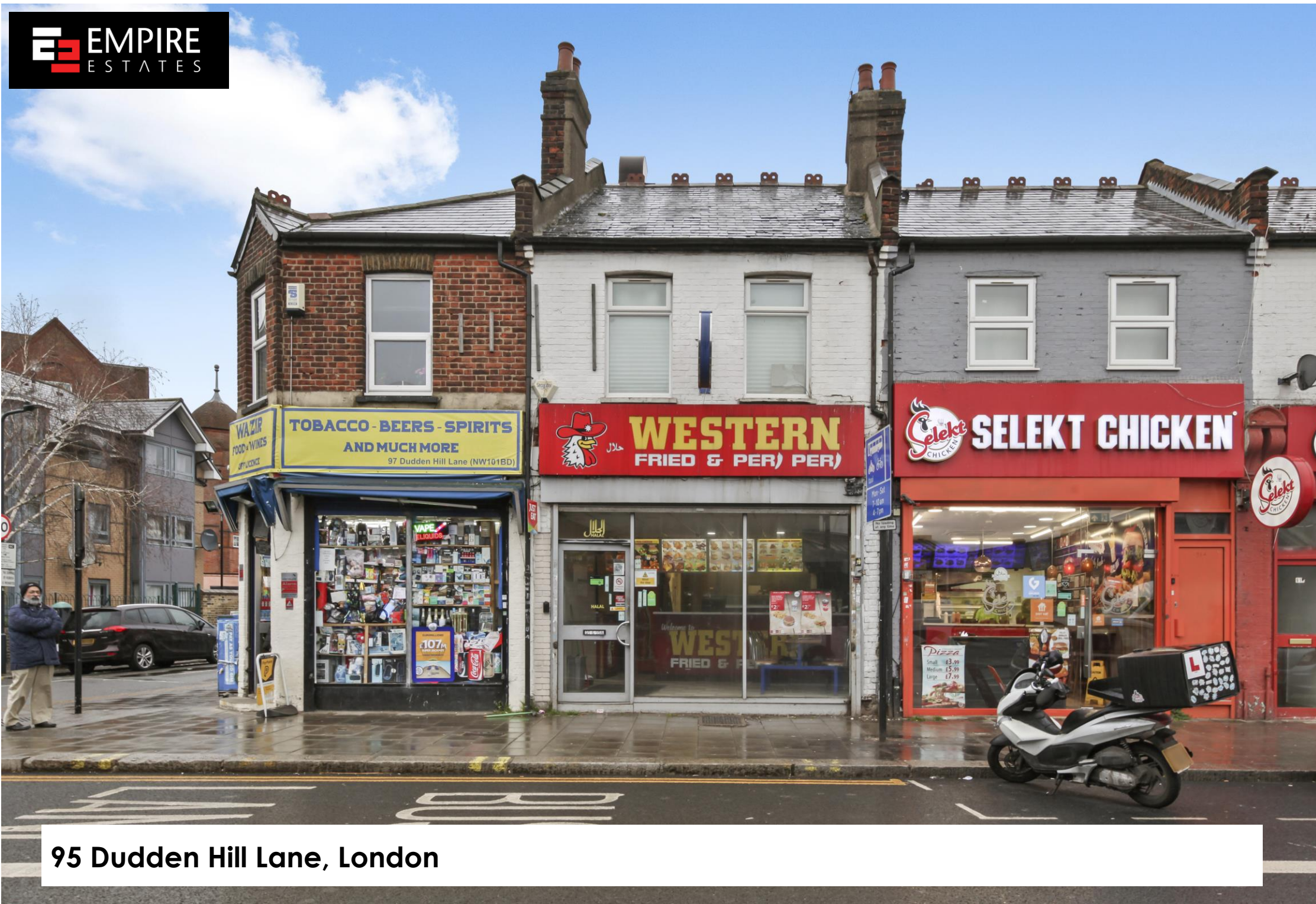
95 Dudden Hill Lane, London