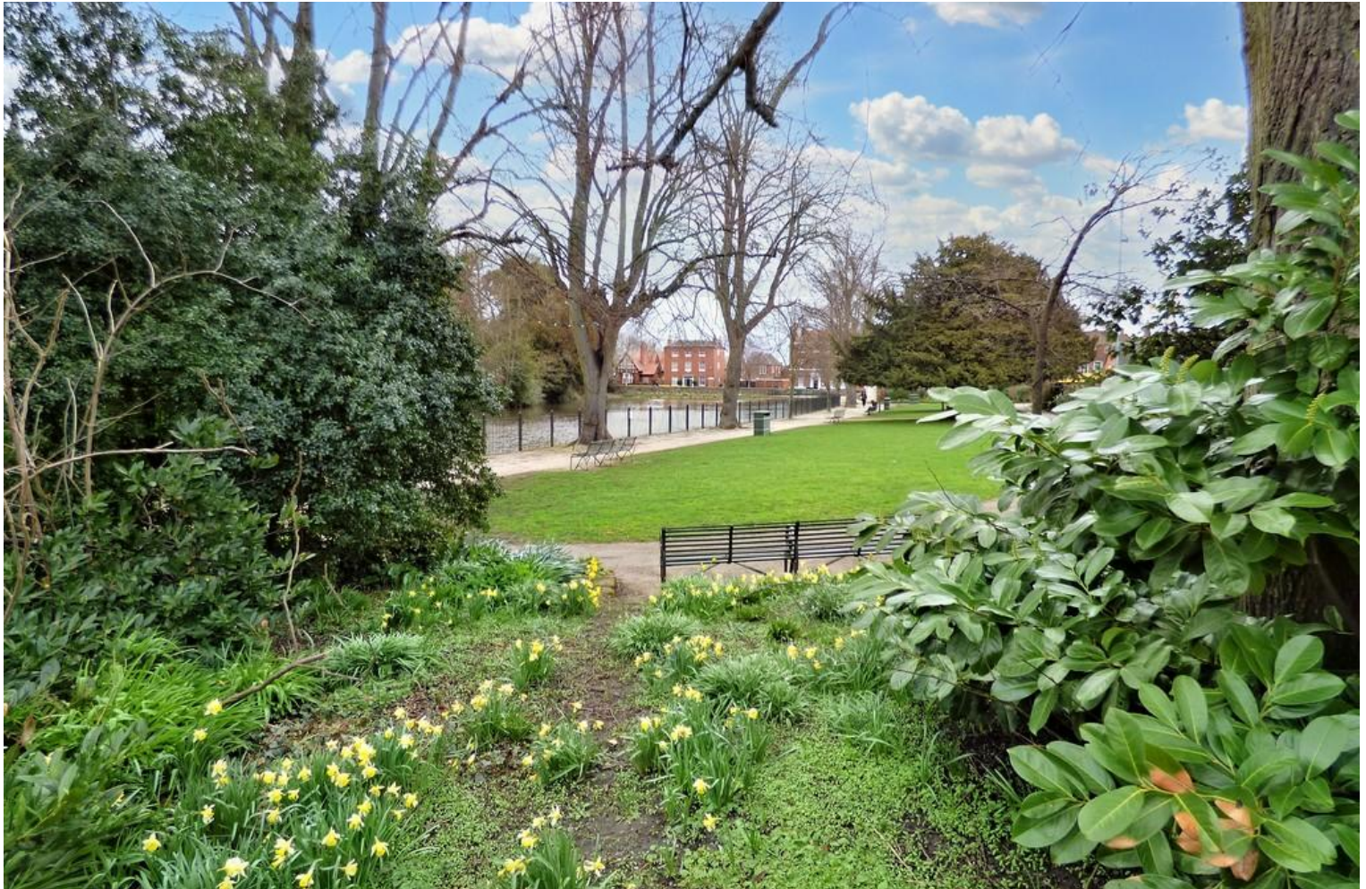
Nearby Beacon Park