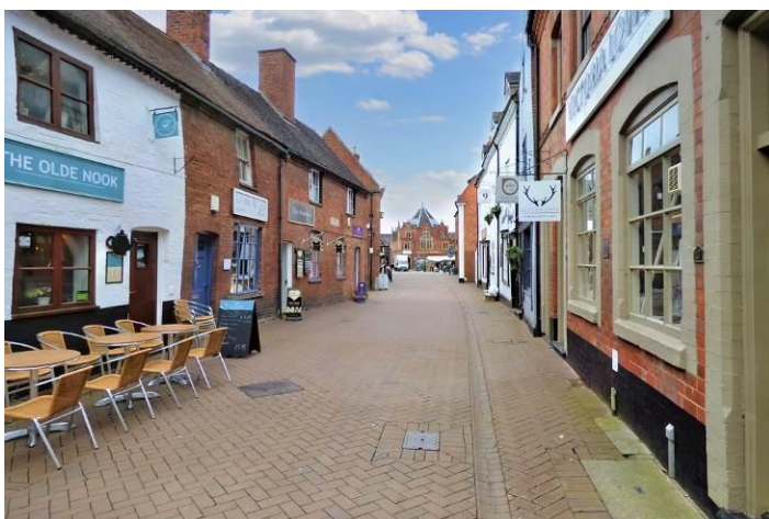
Nearby Dam Street