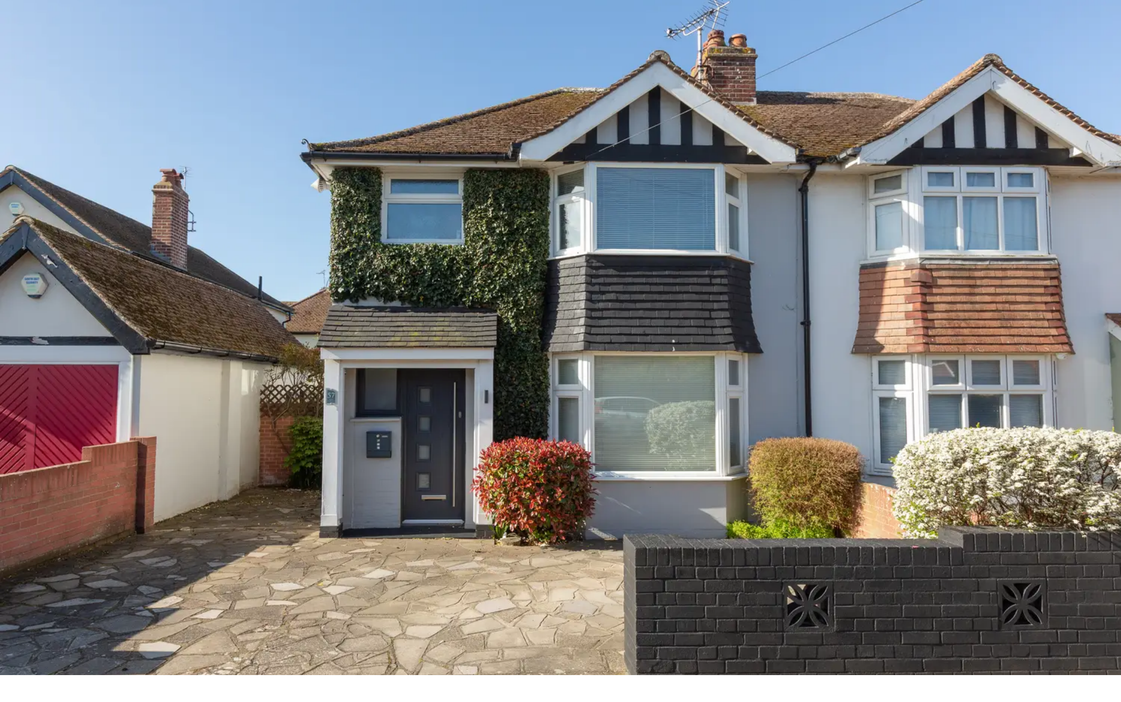
57 Kent Gardens, Birchington £385,000