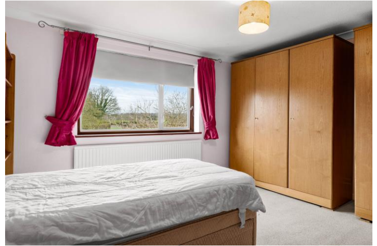
Bedroom Three 12' 9" (3.89m) x 12' 0" (3.66m)