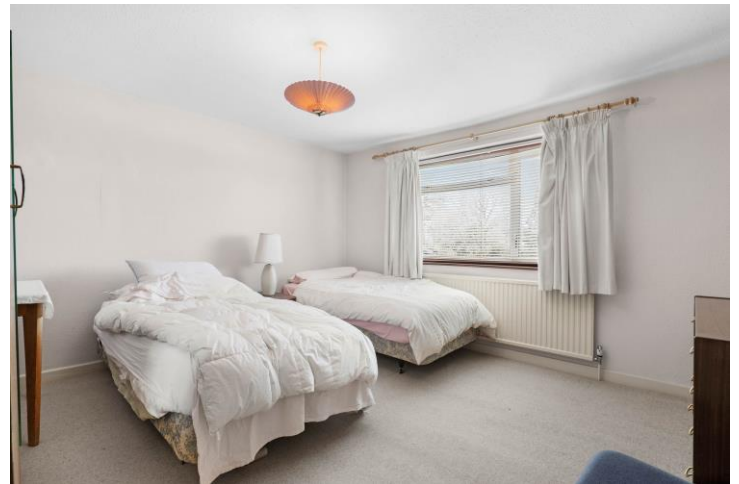
Bedroom Four 12' 9" (3.89m) x 12' 1" (3.68m)