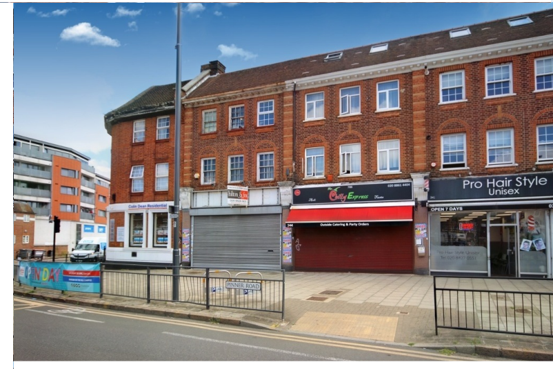
Asking Price £875,000