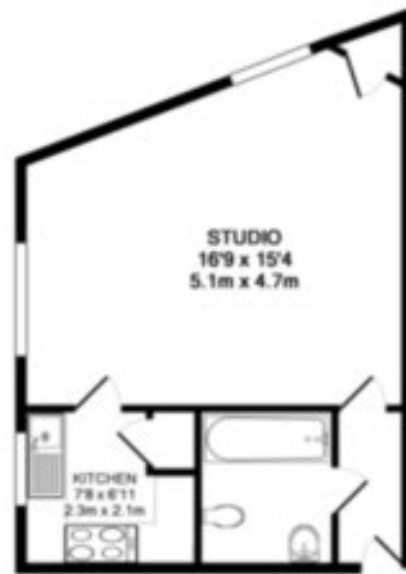
TOTAL APPROX. FLOOR AREA 349 SQ.FT. (32.4 SQ.M.) Measurements are approximate. Not to scale. Illustrative purposes only Made with Metropix 02013