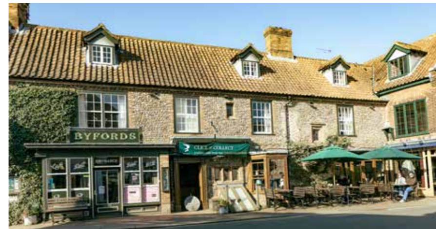
Byfords is believed to be the oldest house in Holt.

“The town has such a thriving community, it's the perfect place to form strong social connections...”