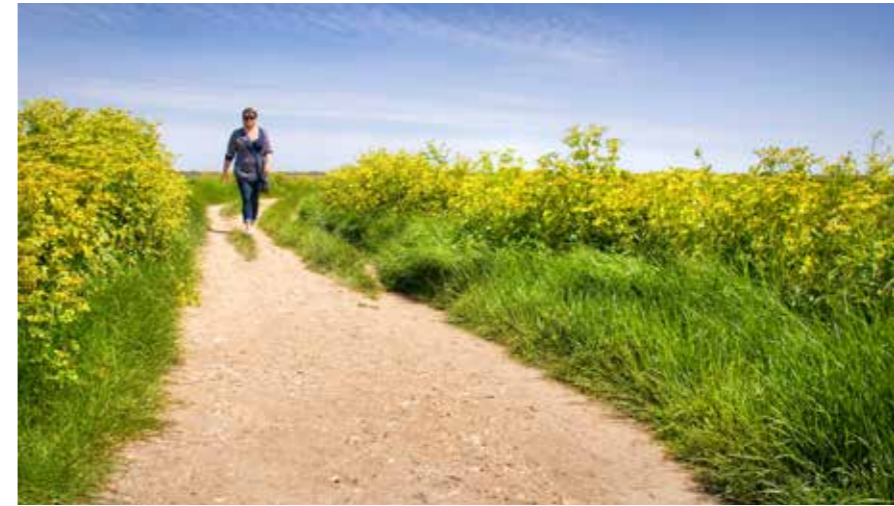
Blakeney offers beautiful scenery and some lovely walks.

“Living here you can enjoy a fantastic local coffee before heading out for an embracing coastal walk.”