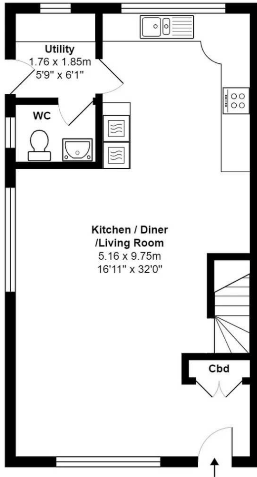
Ground Floor Area: 50.3 m 2 ... 542 ft 2