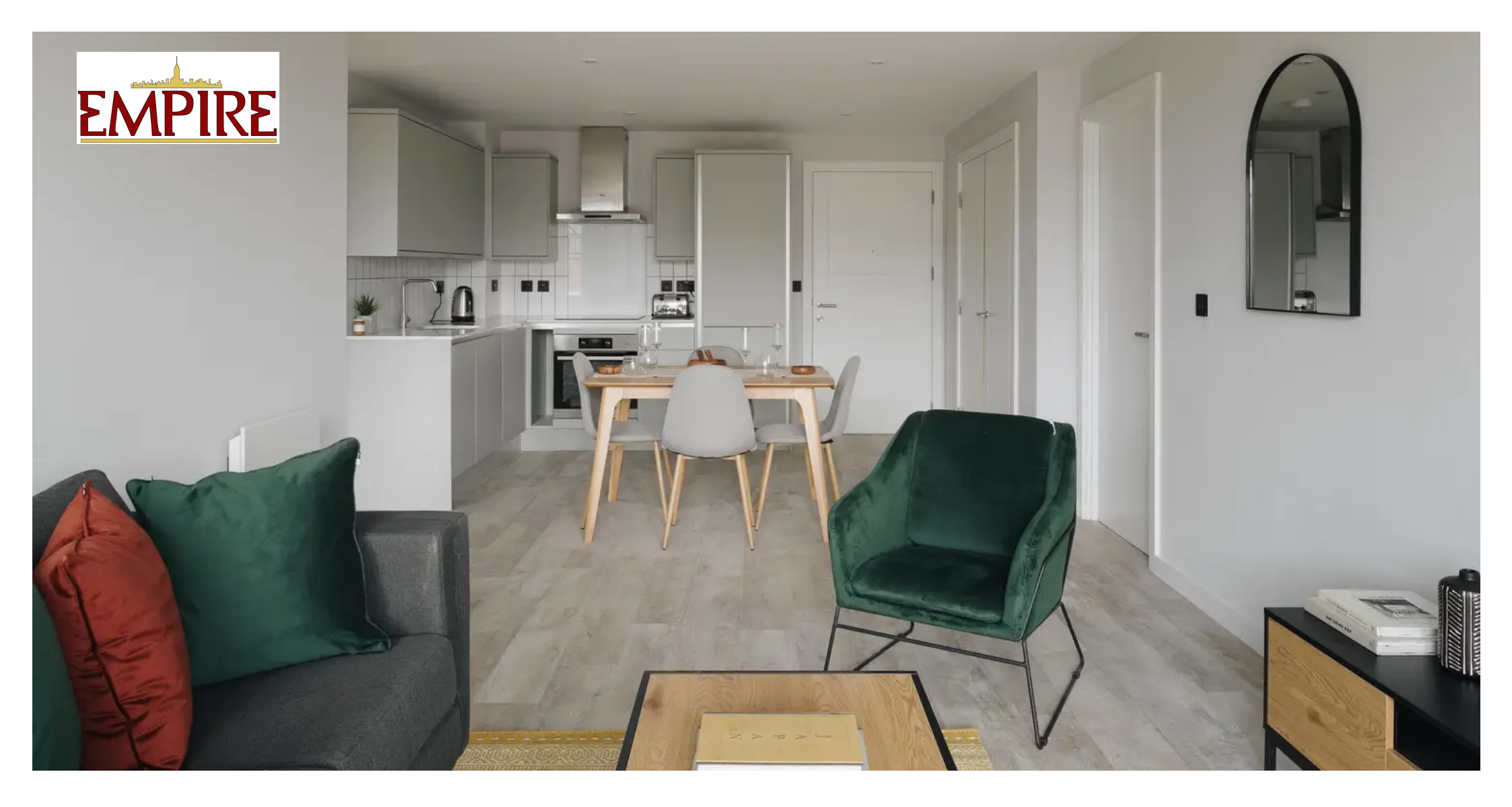
APT 21 Apex Lofts, 20, Warwick Street Bimringham