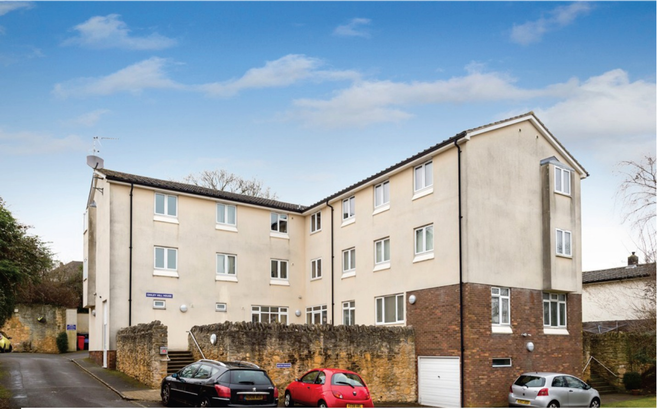
Dailey Hill House, Witney