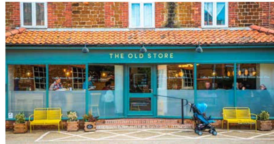
The Old Store

"The Old Store is a lovely local spot to enjoy a cup of coffee after a stroll through the village."