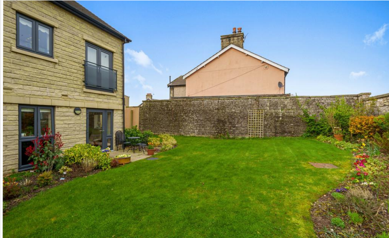
Private Patio and Communal Gardens