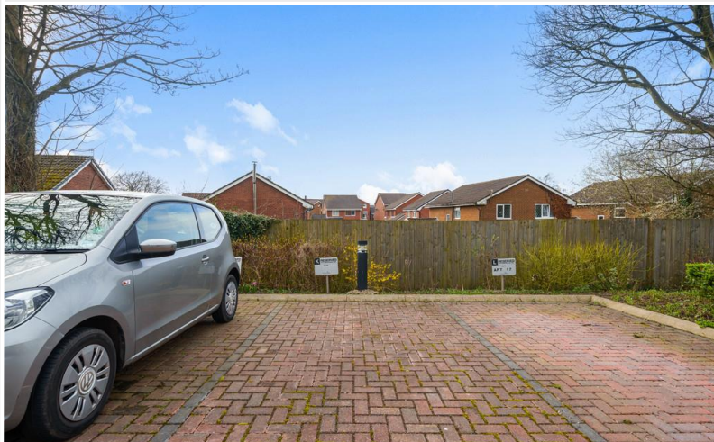
Allocated Parking Space