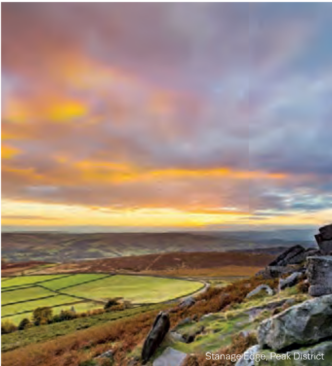
Stanage Edge, Peak District

Nestled in the beautiful county of Derbyshire, just on the edge of the Peak District, Skylarks is surrounded by fresh, open countryside and natural beauty. It's also extremely well-connected, only 5 minutes from the market town of Chesterfield and a short drive from Sheffield. Families will find it a dream spot to settle and grow, while young professionals and those working in the city will relish the escape at the end of a long week. With something for everyone, what will it offer you?