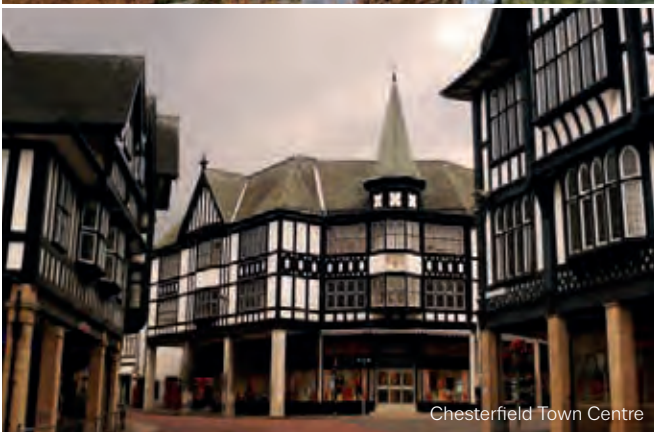
Chesterfield Town Centre