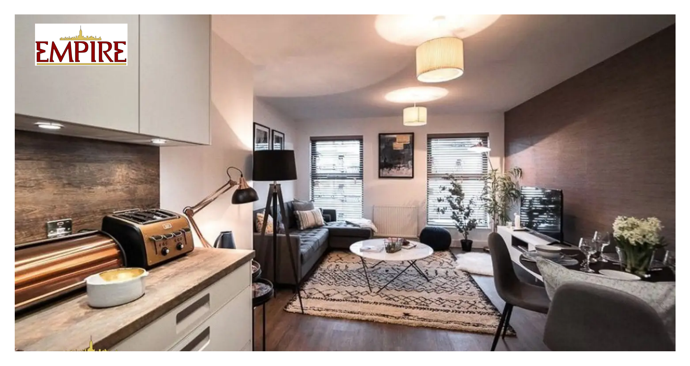
Apt 9, 98 Tennant Street, Birmingham