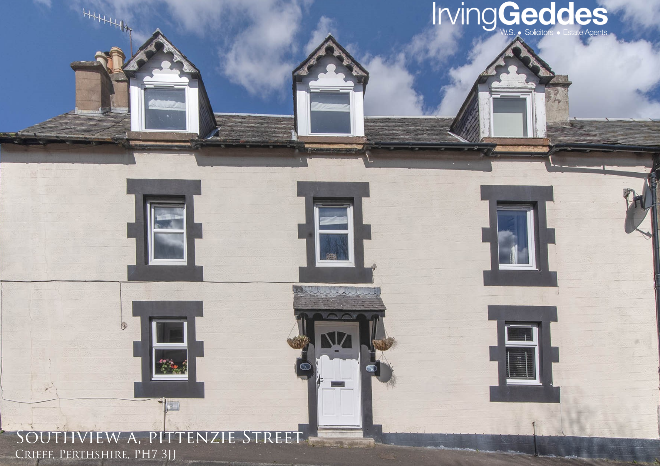
SOUTHVIEW A, PITTENZIE STREET CRIEFF, PERTHSHIRE, PH7 3JJ