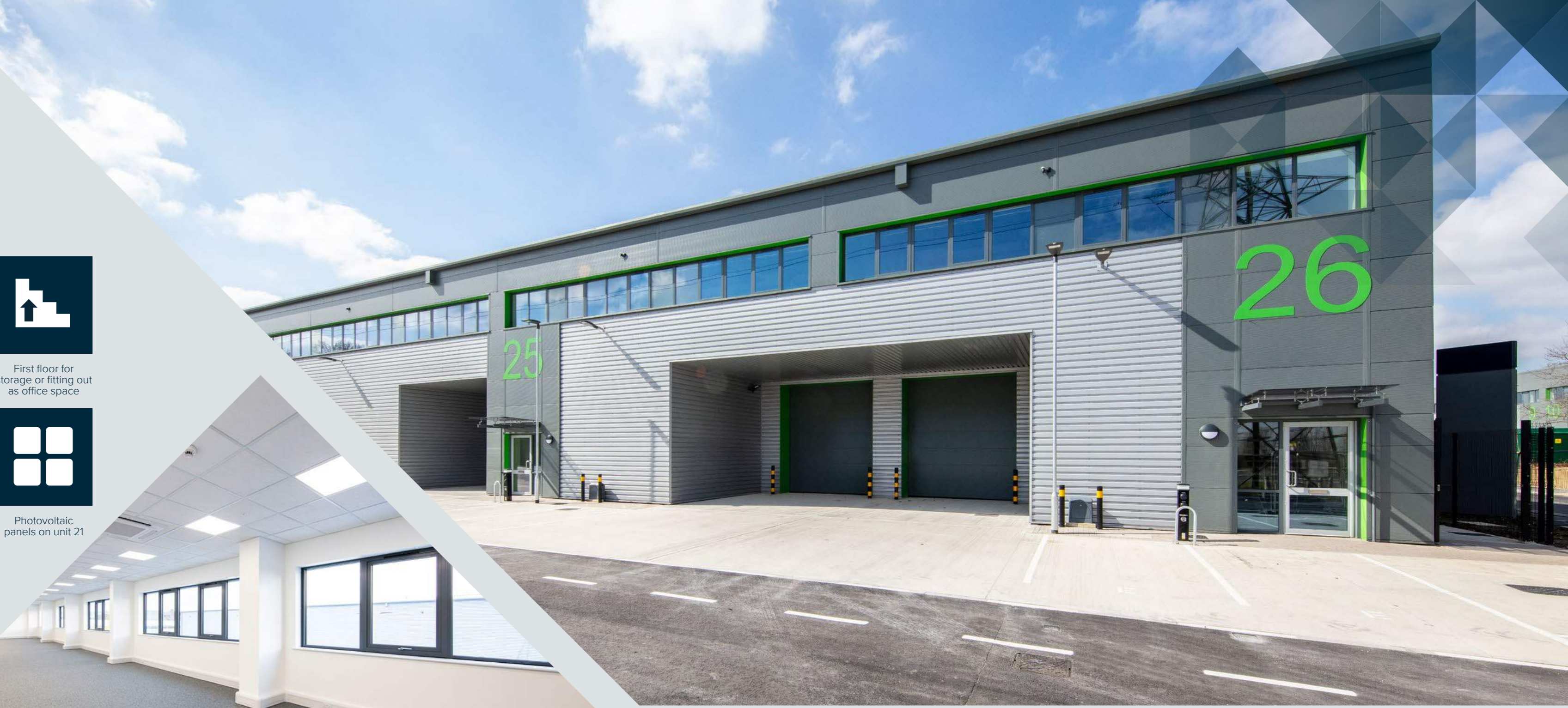
Indicative image from similar development

Units are available to lease on terms to be agreed.