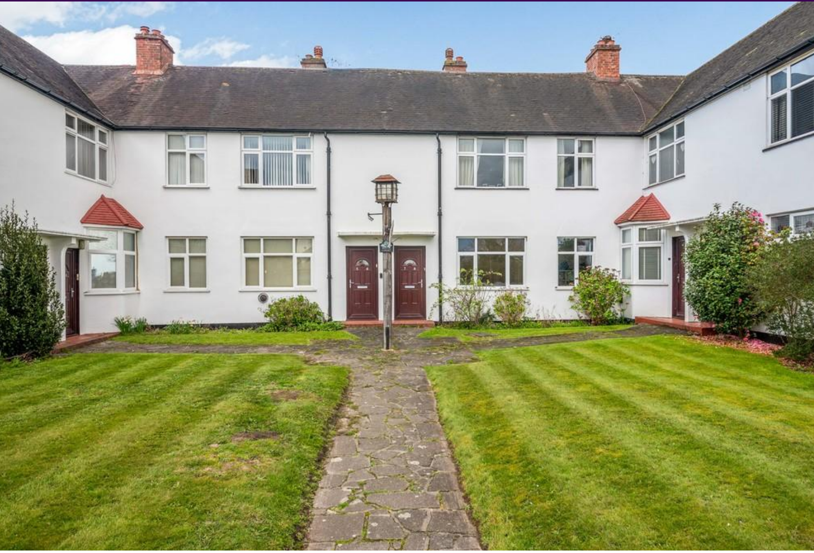
First floor flat