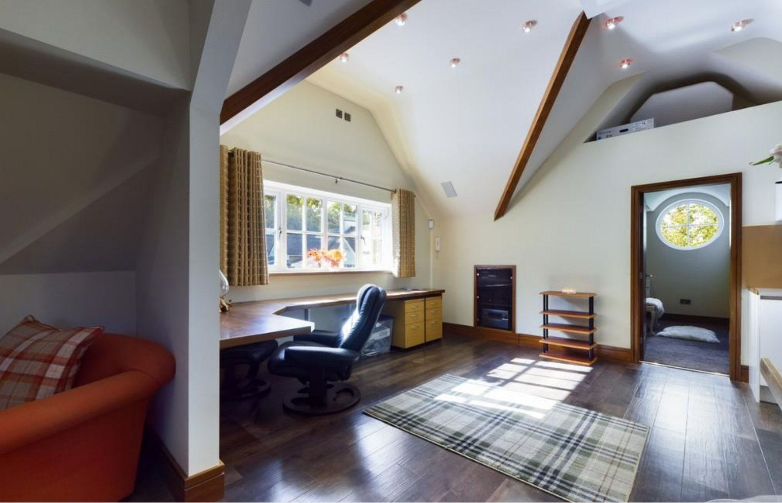
Open plan kitchen, living area