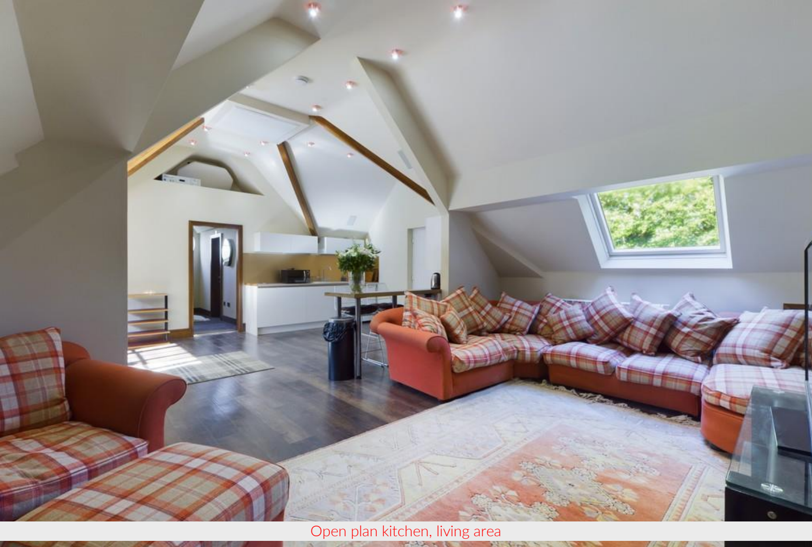
Open plan kitchen, living area

Location: Property is located in the Storrs Park area approximately 3 miles South of Bowness-On-Windermere, occupying most private and peaceful location.