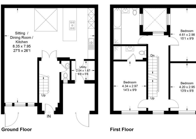
Illustration for identification purposes only, measurements are approximate, not to scale. Imageplansurveys @ 2023