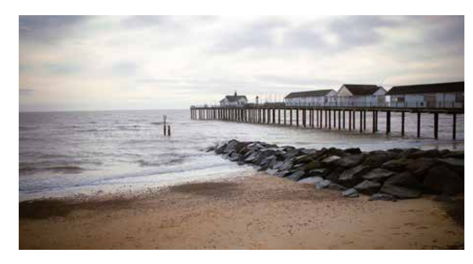
Southwold is just over an hour away.

"Southwold is one of our favourite places. We love the sea, and walks in the countryside."