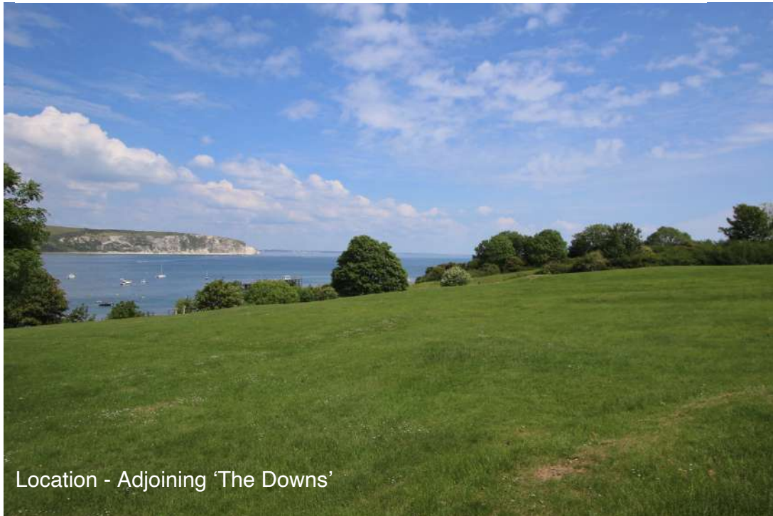
Location - Adjoining 'The Downs'