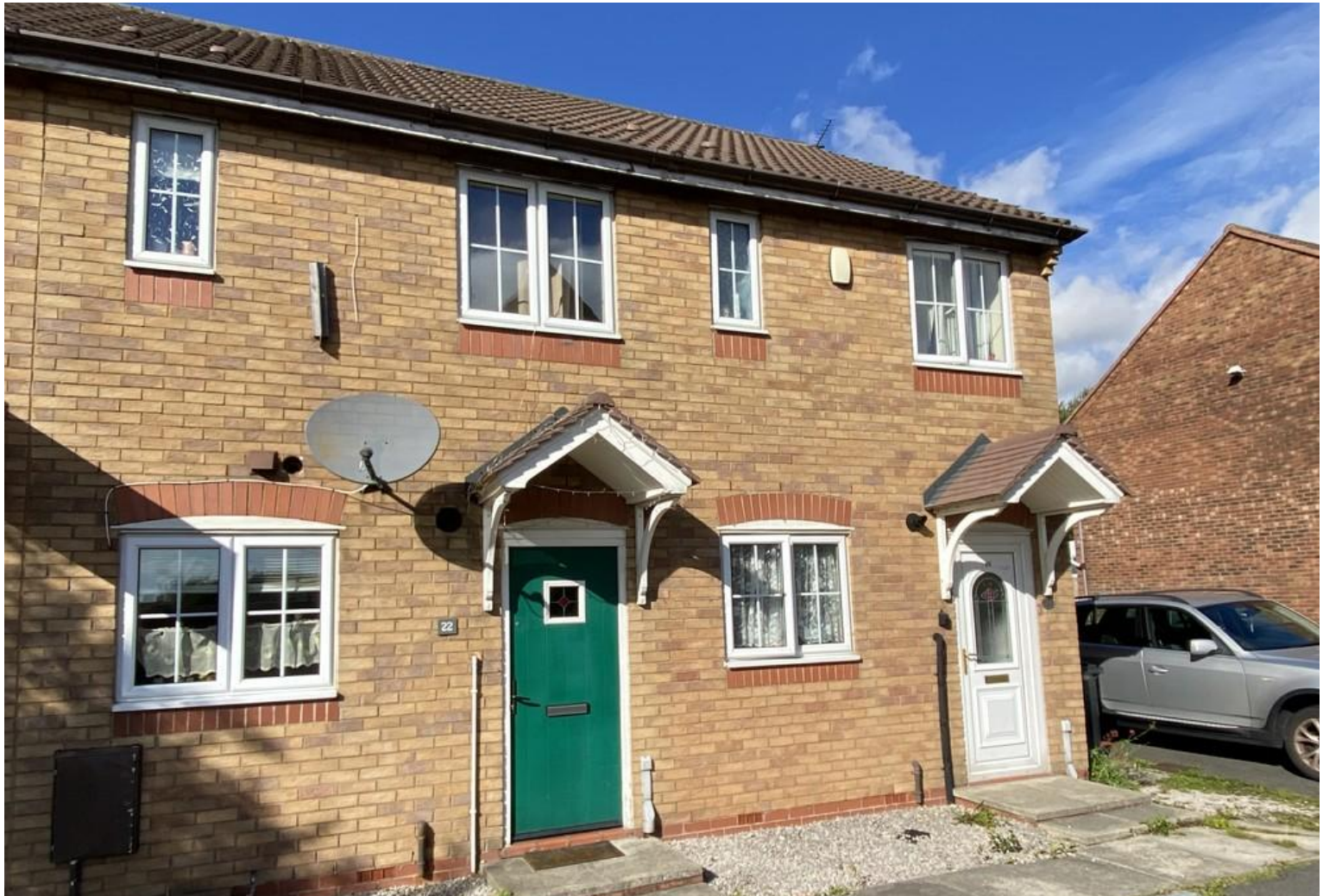
22 Sark Gardens, Blackburn

2 Preston New Road, Blackburn, Lancashire, BB2 1AW Tel. 01254 582489 Email. blackburn@proctorsestateagents.co.uk Web. proctorsestateagents.co.uk