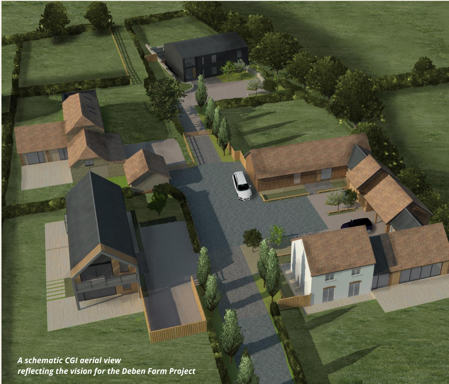
A schematic CGI aerial view reflecting the vision for the Deben Farm Project